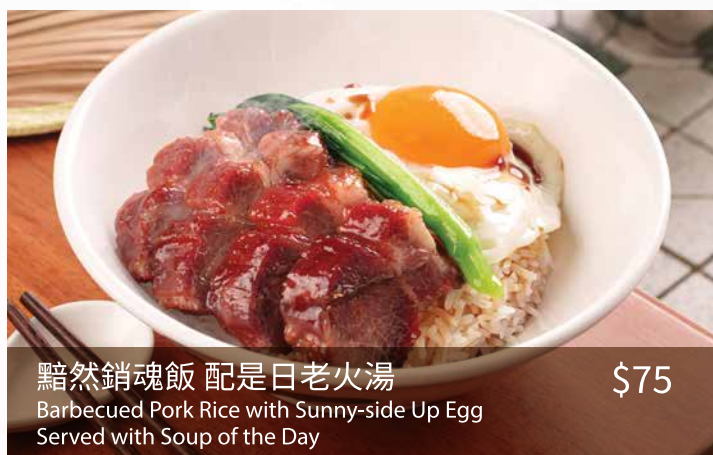
黯然銷魂飯 配是日老火湯 Barbecued Pork Rice with Sunny-side Up Egg Served with Soup of the Day