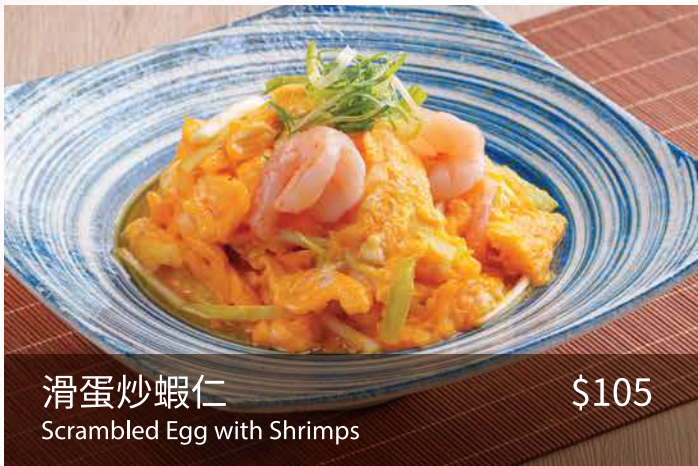
滑蛋炒蝦仁 Scrambled Egg with Shrimps

下列均配 是日老火湯 及 絲苗白飯一碗 Served with Soup of the Day and Steamed Rice