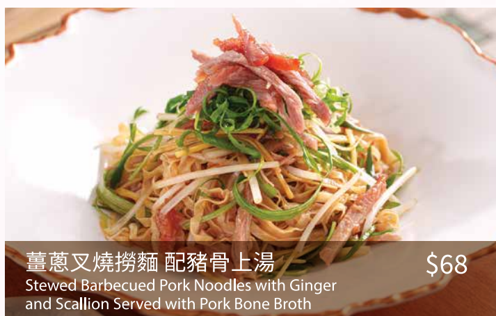
薑蔥叉燒撈麵 配豬骨上湯 Stewed Barbecued Pork Noodles with Ginger and Scallion Served with Pork Bone Broth