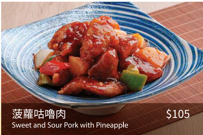
菠蘿咕嚕肉 Sweet and Sour Pork with Pineapple