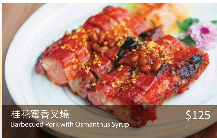
桂花蜜香叉燒 Barbecued Pork with Osmanthus Syrup