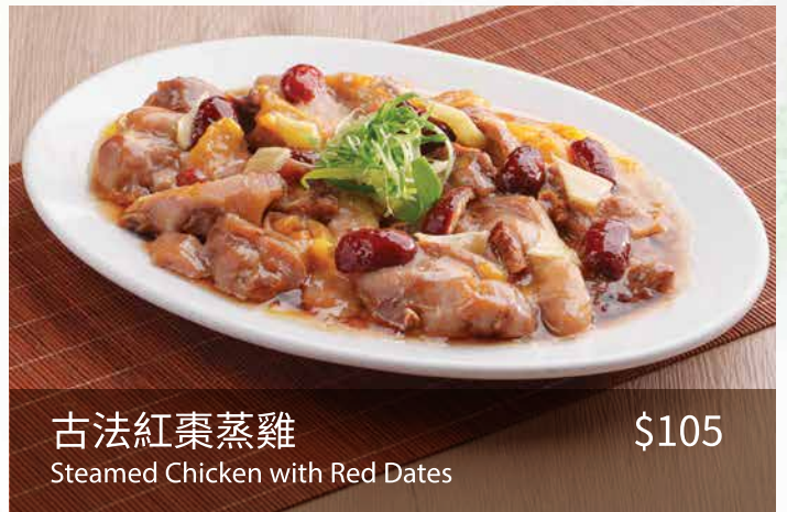
古法紅棗蒸雞 Steamed Chicken with Red Dates