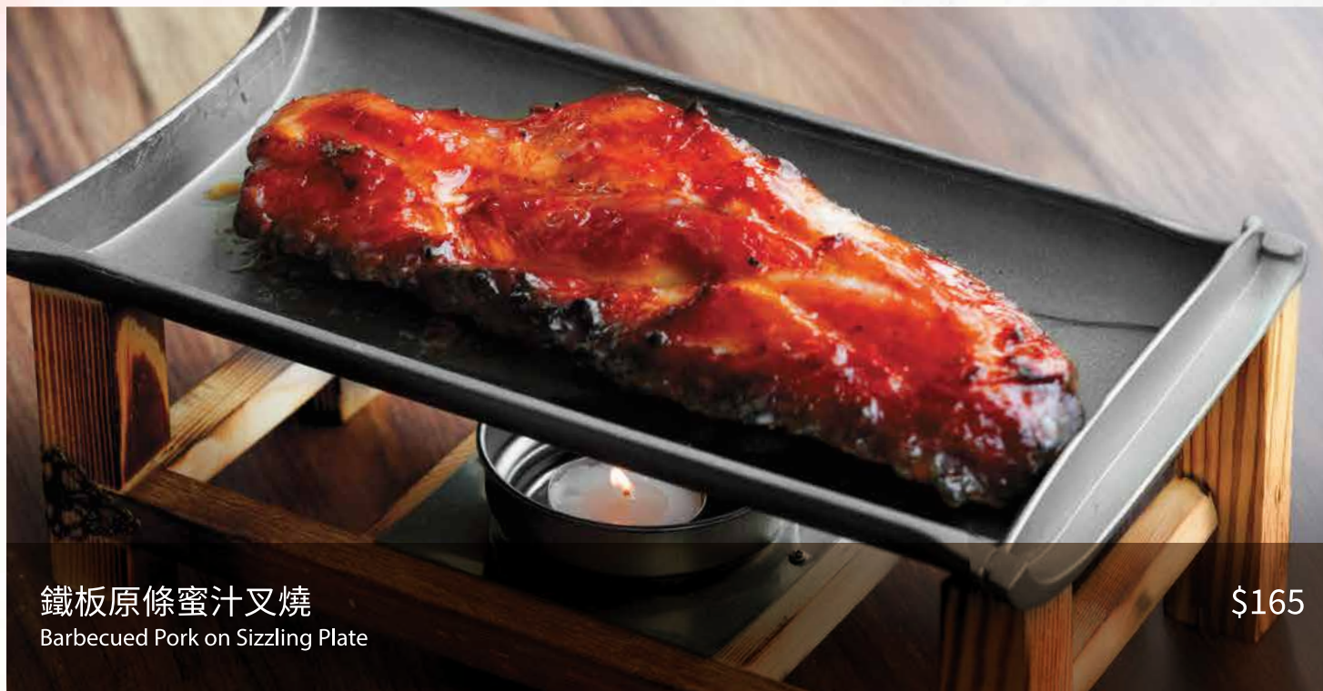
鐵板原條蜜汁叉燒 Barbecued Pork on Sizzling Plate

價目以港幣計算 • 不設加一 PRICES STATED ARE IN HONG KONG DOLLARS • NO SERVICE CHARGE