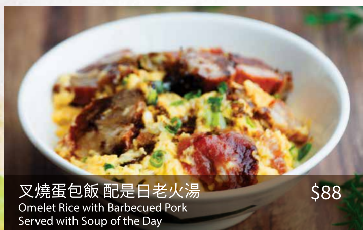
叉燒蛋包飯 配是日老火湯 Omelet Rice with Barbecued Pork Served with Soup of the Day