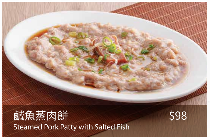
鹹魚蒸肉餅 Steamed Pork Patty with Salted Fish